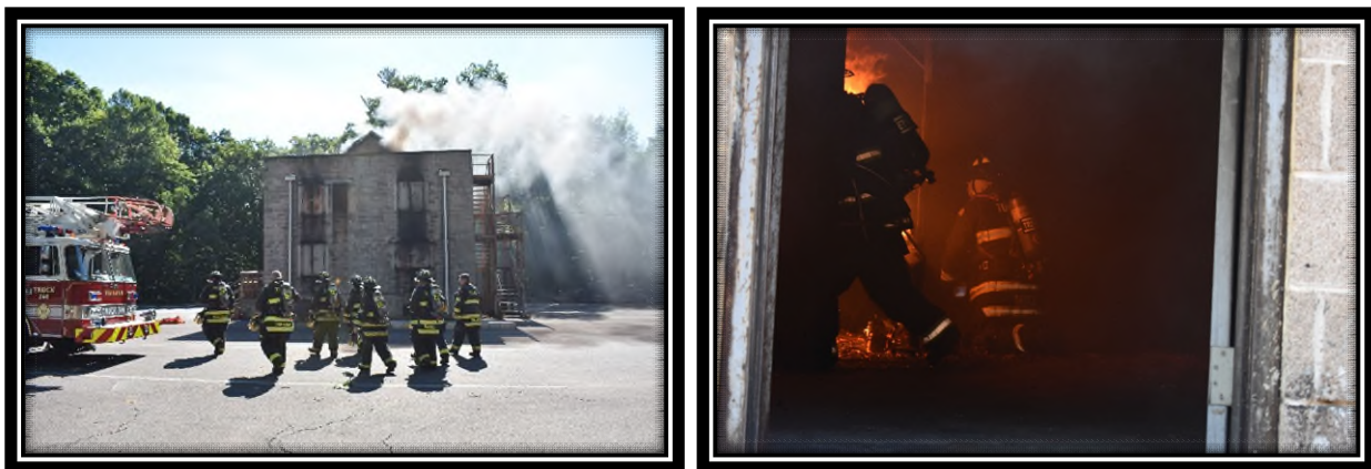
Firefighters Practice Skills during Live Burn Training – June 25, 2022