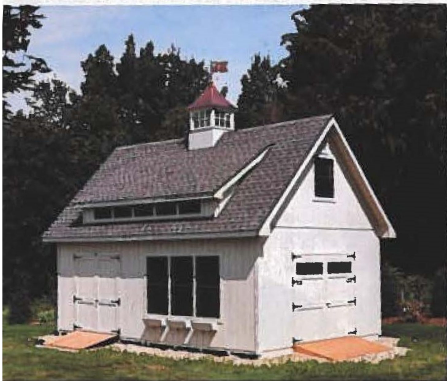
16' x 24' Cape