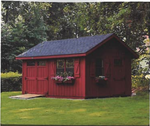
12' x 16' Cape