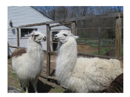
This department is responsible for more than just domestic animals.