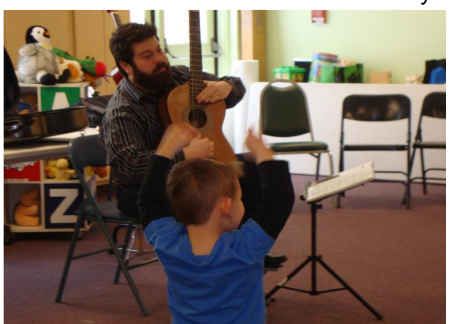
Take Your Child to the Library