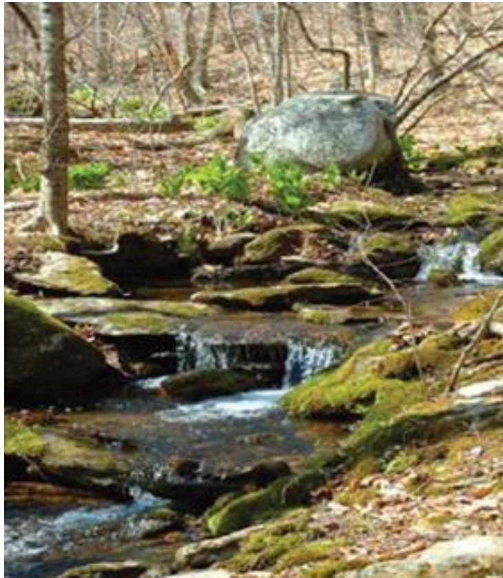
A Passive Recreation Open Space Conservation Area

Adopted by Commission: 2/12/2009; Revised 3/13/2014; Revised 4/23/2020